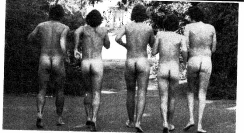
'We're off to see the wizard ...